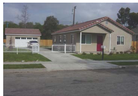
The Gonzalez Family Home, dedicated on March 3, 2006.

Rolling Hills Covenant Church 2222 Palos Verdes Drive North Rolling Hills Estates, CA 90274