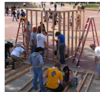
Habitat UCLA students participate in Act! Speak! Build Week

HABITAT UCLA is a group of dedicated students who work together to build, fundraise and teach others about HFH and this spring they are very busy. From March 28 th to April 1 st Habitat UCLA members participated in the alternative spring break program known as Collegiate Challenge.