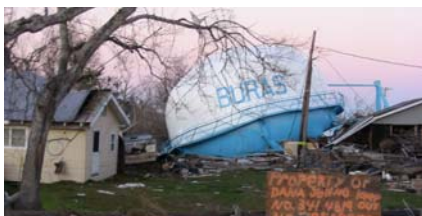
Devastation in Buras, LA